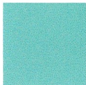
Pantone 3252 C

See full product label for First Aid and Directions for Use. Directions for Use: For use in Bell Labs PROTECTA EVO Express bait station only. Applicator must be in possession of the full label at the time of application. Replace at least every 1 month. To use new bait insert (tank and feeder tray): 1. Remove cap, keeping the opening down, screw tank onto tray while keeping it level. Do not overtighten. 2. The flow of liquid should begin immediately. Do not squeeze tank to encourage flow of bait. To reuse feeder tray with new tank: 1. Remove insert (tank and tray) from bait station. Keep insert level to limit spills. 2. Slowly rotate insert away from you, as indicated by arrow on top of the tank, until feeder tray is on top. 3. Hold insert in this position for approximately 5 seconds to ensure all bait flows back into tank. 4. Unscrew feeder tray from tank and flip tray over until it is in upright position. 5. Remove cap on the new tank and keeping the opening down, screw the tank onto the tray. Do not overtighten. 6. The flow of liquid should begin immediately. Do not squeeze tank. 7. Screw new tank cap onto old tank and dispose in trash. Disposal: Do not re-use empty bait insert. If empty: Place container in trash or offer for recycling. If partly filled: Cap the container and place in the trash.